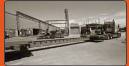
GOOSENECK EXTENDED 6M