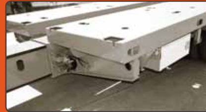
LOW PROFILE MAIN BEAM