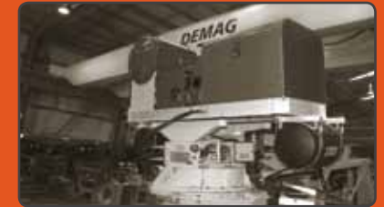
STANDARD SPARE TYRE WATER TANK & POWER PACK ARRANGEMENT