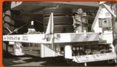
HYDRAULIC CONTROLS AND STORAGE