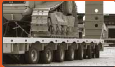
ALIGNMENT AND AUTO PRESSURISE STEERING SYSTEM