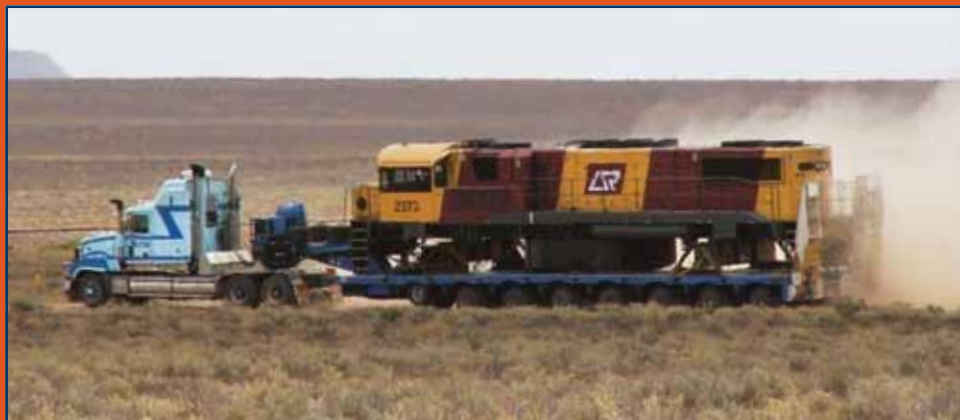
DRAKE 8 ROWS OF 8