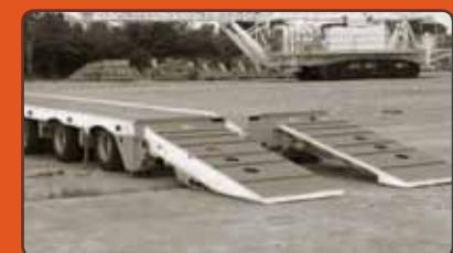
STANDARD RAMP IN LOWERED POSITION