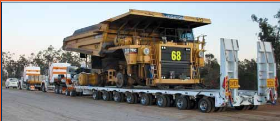
DRAKE 2 x 8 DOLLY AND 8 ROWS OF 8