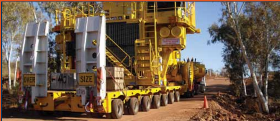
DRAKE 2 x 8 DOLLY AND 7 ROWS OF 8