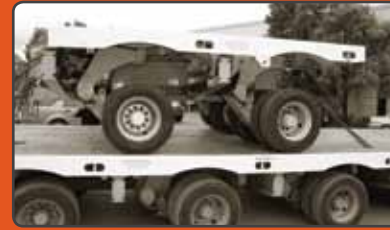
OPTIONAL ROWS OF 8 WITH JOINT KIT