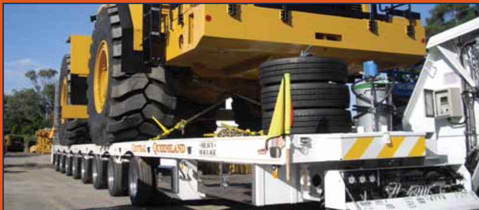
DRAKE 8 ROWS OF 8