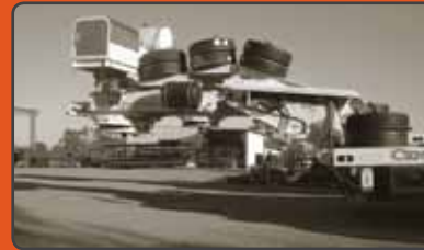
FORCED STEERING SYSTEM