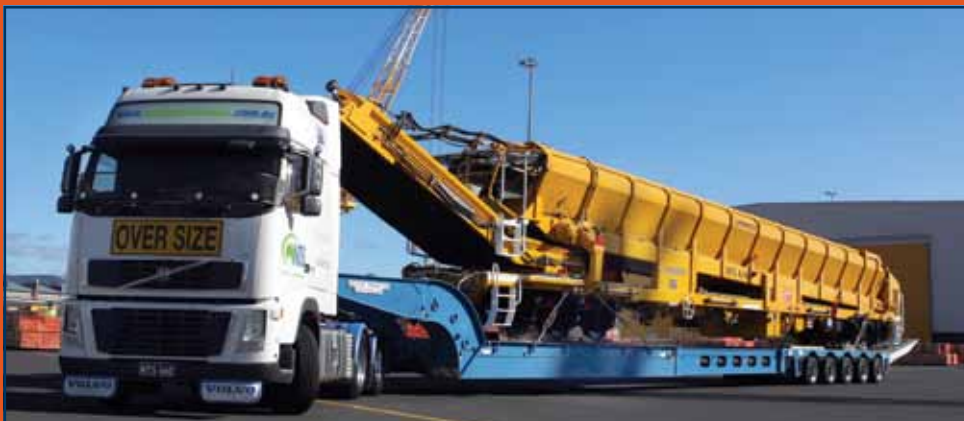
DRAKE 5 x 8 LEVEL DECK EXTENDABLE