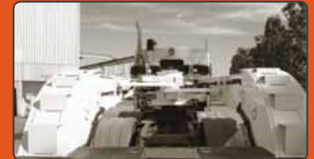
HYDRAULIC WIDENING FROM 2.5M TO 4.27M OR 2.7M TO 4.6M