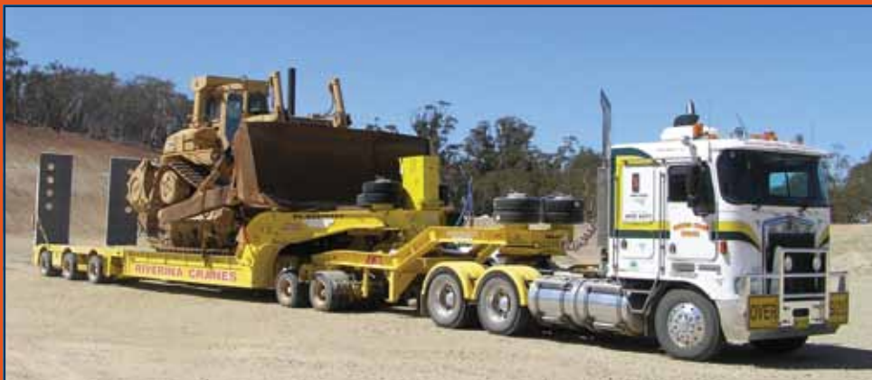
DRAKE 2 x 8 DOLLY AND 3 x 8 LEVEL DECK EXTENDABLE