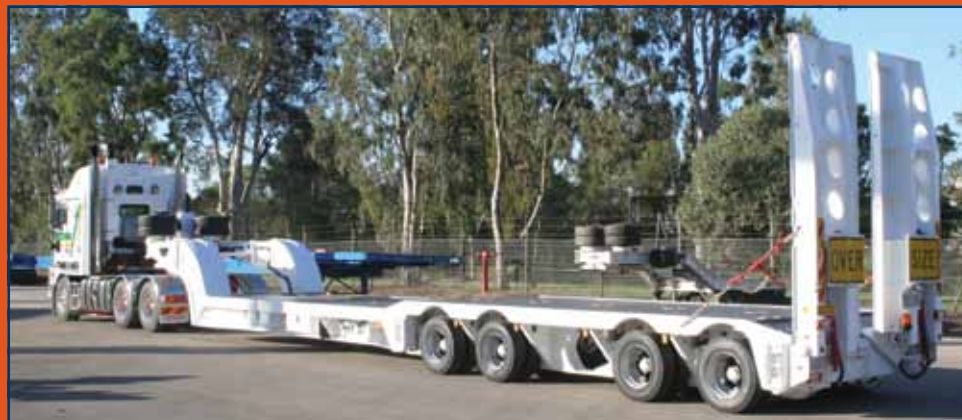
DRAKE 4 x 8 DROP DECK