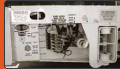
HYDRAULIC CONTROLS AND LOCKING PINS