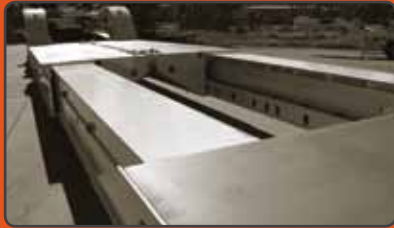
EXTENDABLE DECK SECTION