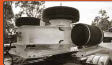
STANDARD SPARE TYRE ARRANGEMENT