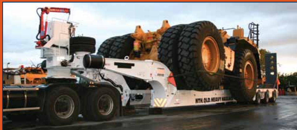
DRAKE 3 x 8 LEVEL DECK EXTENDABLE