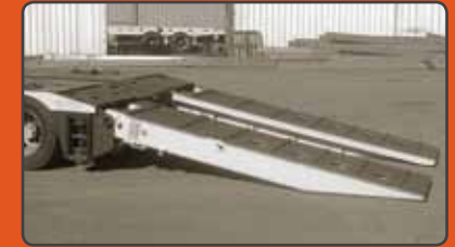
REAR RAMP LOWERED POSITION