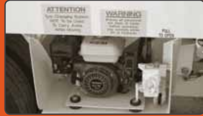
5.5HP PULL-START HYDRAULIC POWER PACK