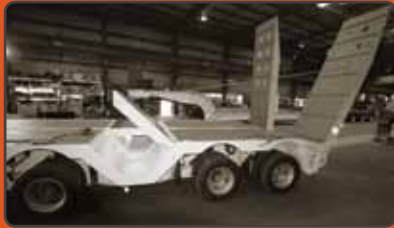
DRAGLINE BUCKET DECK RECESS