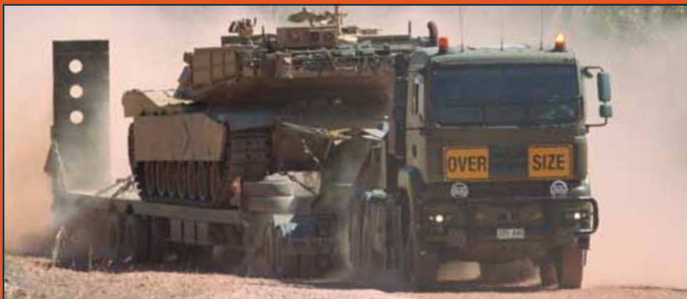
DRAKE 2 x 8 DOLLY AND 4 x 8 LEVEL DECK