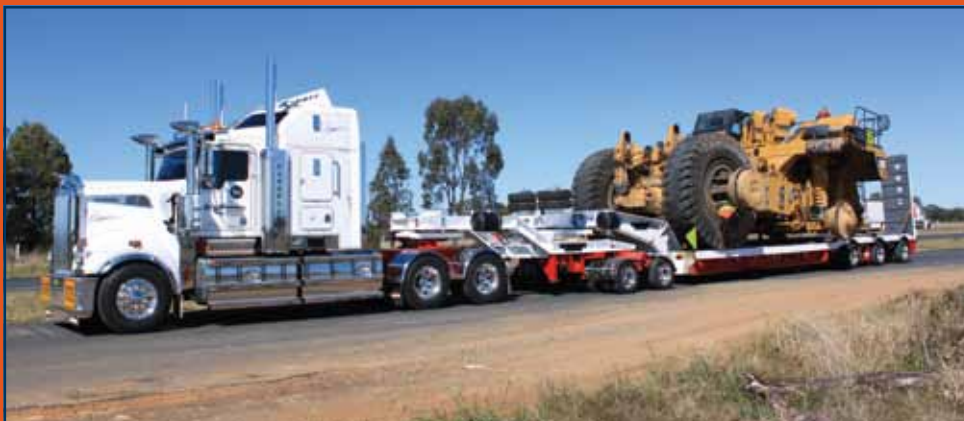
DRAKE 2 x 8 DOLLY AND 3 x 8 DROP DECK