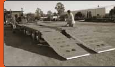
STANDARD REAR RAMP LOWERED POSITION