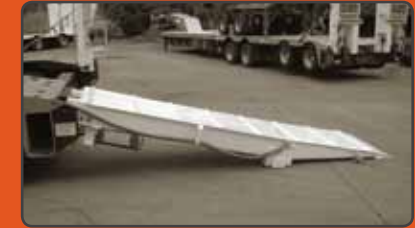
DOUBLE HUNG REAR RAMP