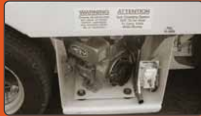
6HP DIESEL ELECTRIC START POWER PACK