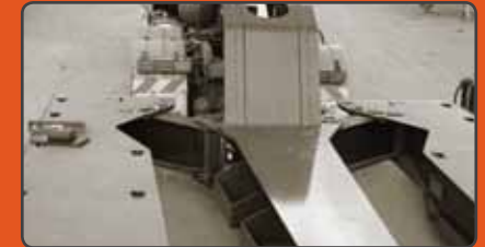
HYDRAULIC WIDENING FROM 2.5M TO 4.27M OR 2.7M TO 4.6M