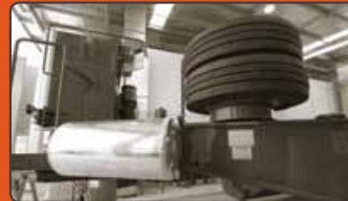
STANDARD SPARE TYRE ARRANGEMENT