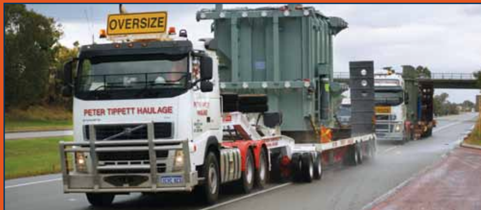
DRAKE 2 x 8 DOLLY AND 4 x 8 LEVEL DECK