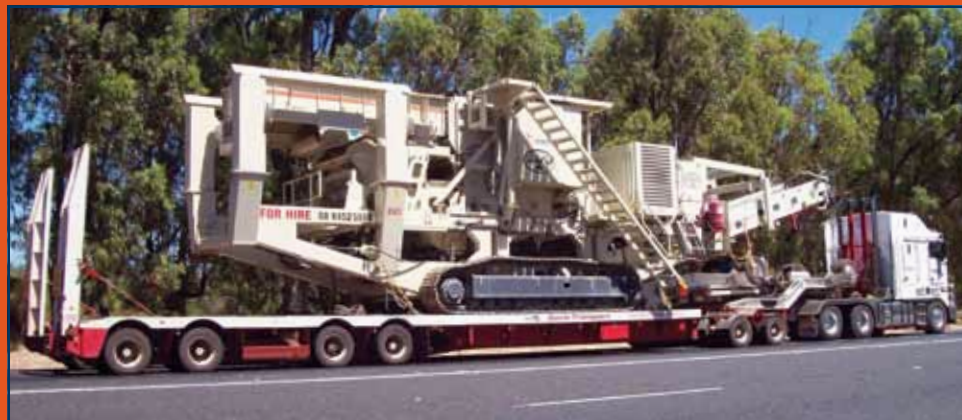
DRAKE 2 x 8 DOLLY AND 4 x 8 LEVEL DECK