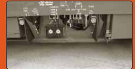
HYDRAULIC TANK WITH HYDRAULIC CONTROLS